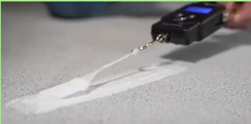
180° Fish Scale Tester