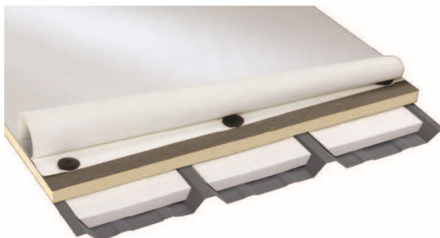
Installation below ISO and Duro-Last membrane