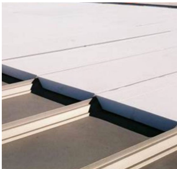
Taper-Cut Flute Filler