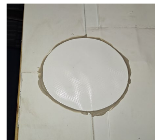
Contrasting caulk color for clarity