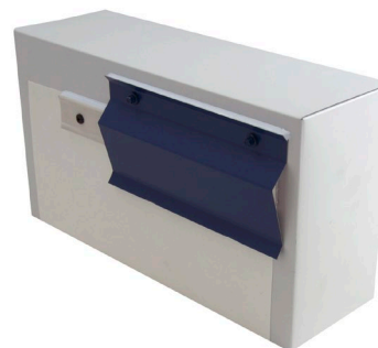
Surface Mount Counterflashing