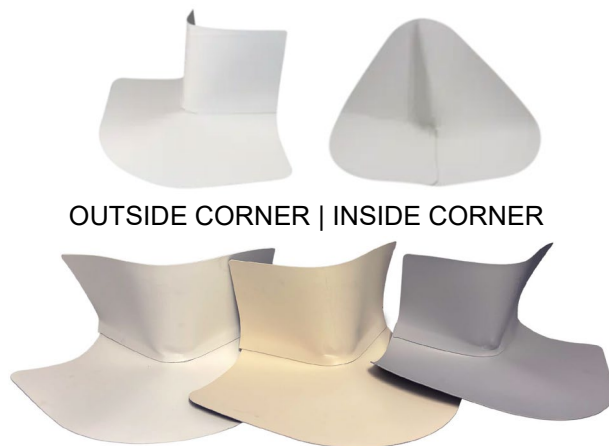
OUTSIDE CORNER | INSIDE CORNER